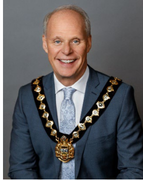
OSHAWA ONTARIO, CANADA